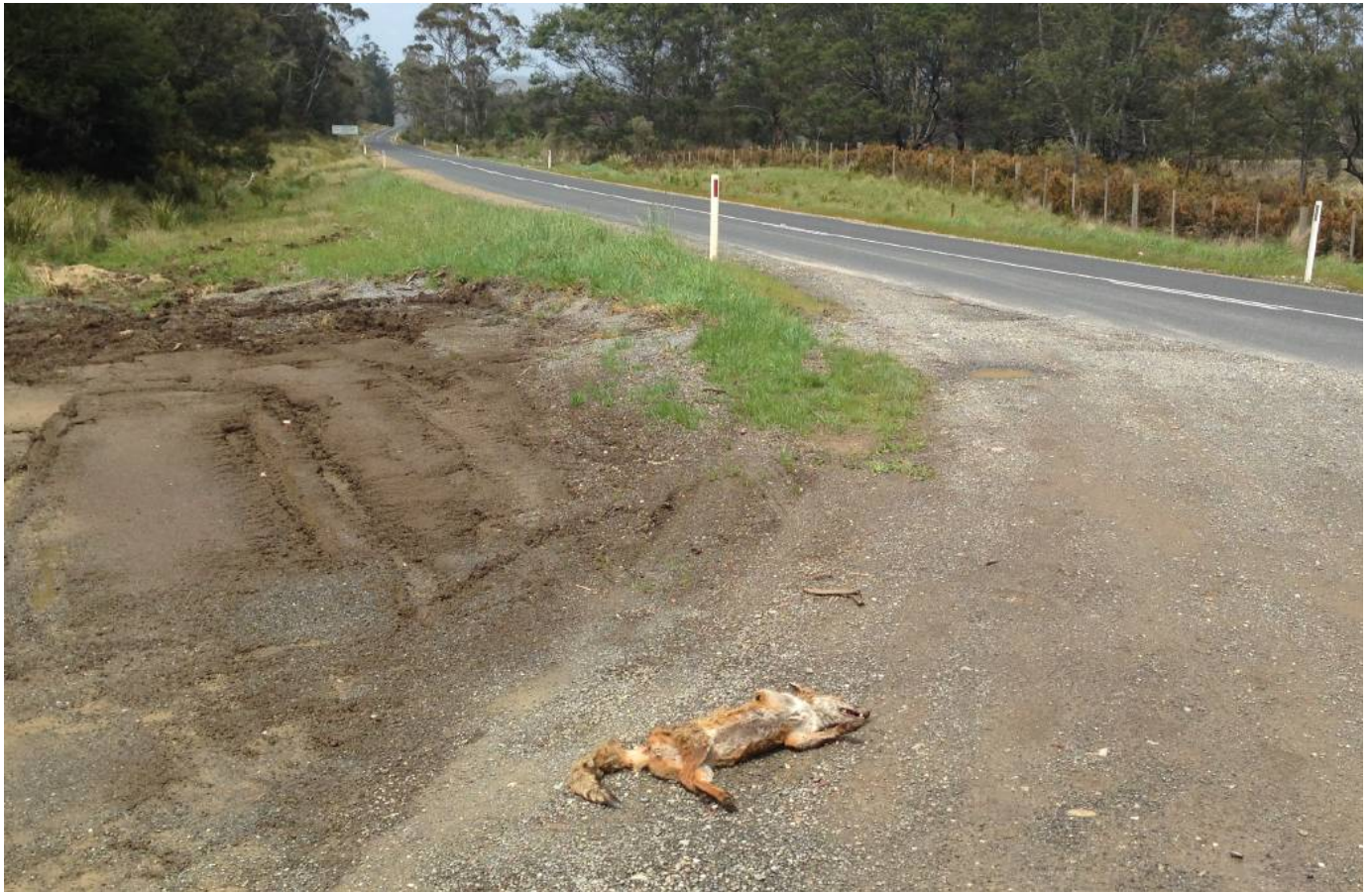
An image of a dead fox found in Northern Tasmania on Sunday.

( mailto:?subject=Fox carcass found I Poll&body=Hi,I found this article - Fox carcass found I Poll, and thought you might like it http://www.examiner.com.au/story/4263401/fox-carcass-found-poll/ )