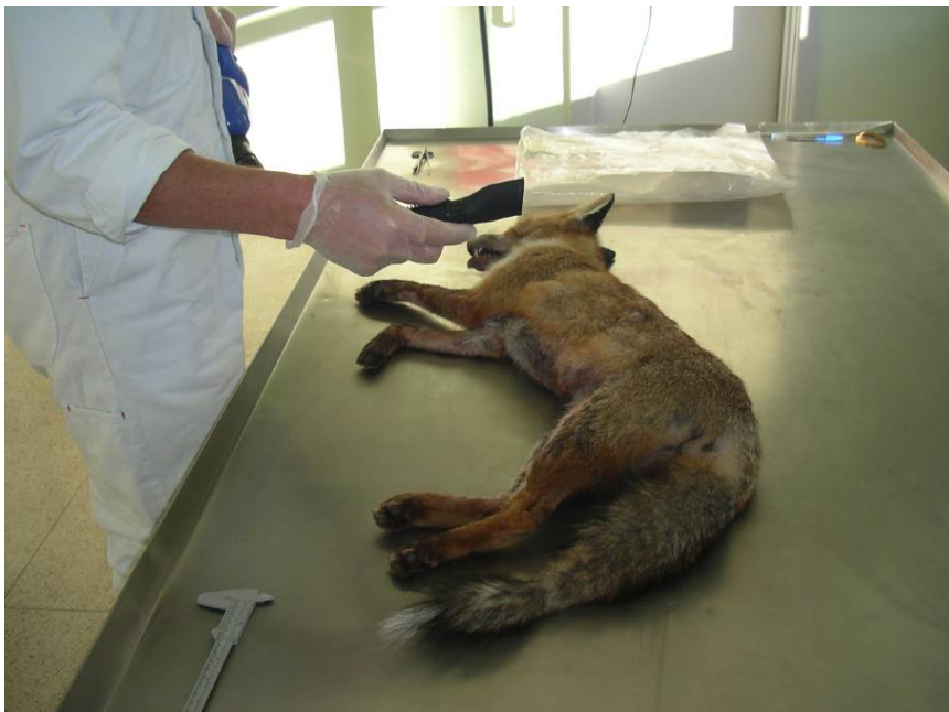
The Glen Esk Road fox at DPIWPE's Mt Pleasant Laboratory in August 2006.